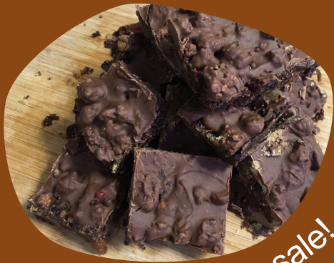
Do a bake sale!