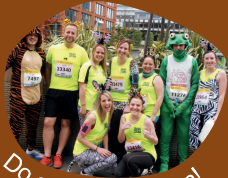
Do a sponsored run!