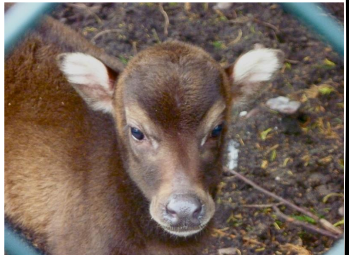
Anoa calf at West Midland Safari Park.