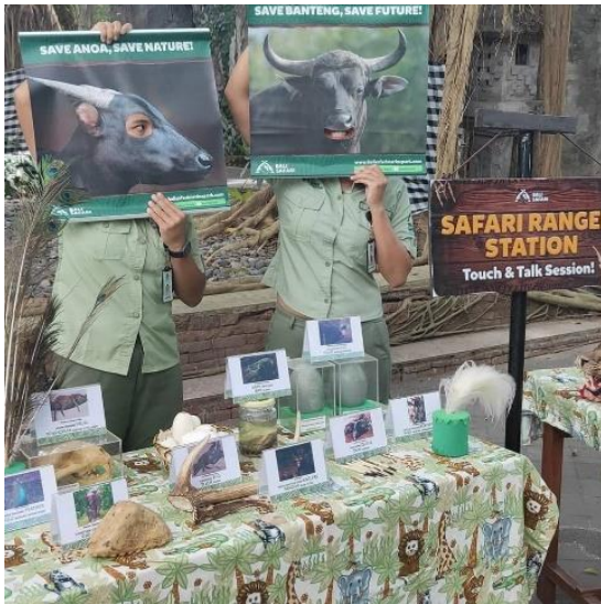
Education stands at Bali Safari and Marine Park.