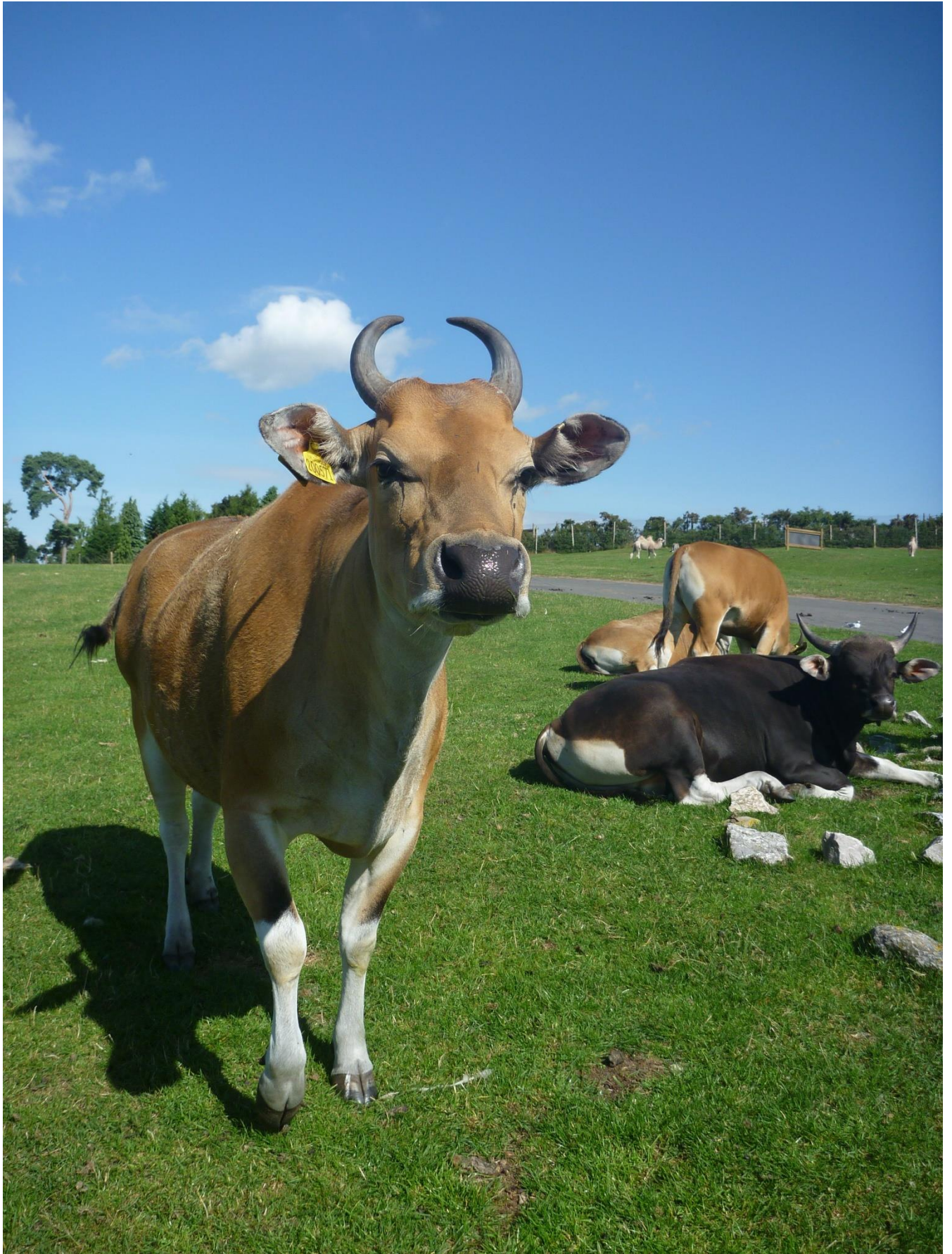
Banteng at West Midland Safari Park.