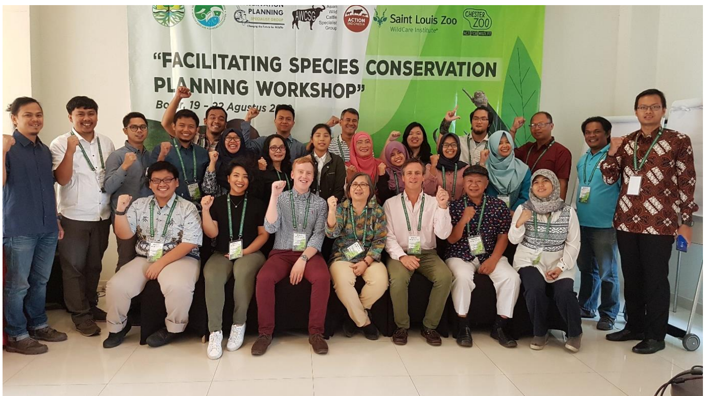
Participants of the August 2019 CPSG Facilitation workshop in Bogor, Java.

Following the workshop, all participants were added to a WhatsApp group to continue networking and receive updates. The aim of this group is for the participants to share experiences and support each other as they put their facilitation skills into practice. At the end of 2019, all participants shared their experiences after the training, as well as activities that worked well or needed improvement, and some useful tools and ideas for activities in 2020. This informal group is coordinated by Yonathan (PKBSI-GSMP Programme Officer), an alumnus of the CPSG mentor scheme – a 12-month long one-on-one training programme in facilitation skills, supported by the GSMPs.