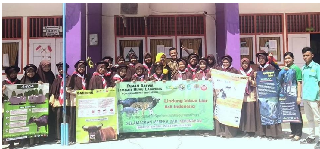
Action Indonesia Day at Taman Satwa Lembah Hijau.

Thanks for the hard work of everyone involved in making Action Indonesia Day 2019 such a success!