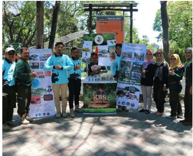
Education activities at Surabaya Zoo.