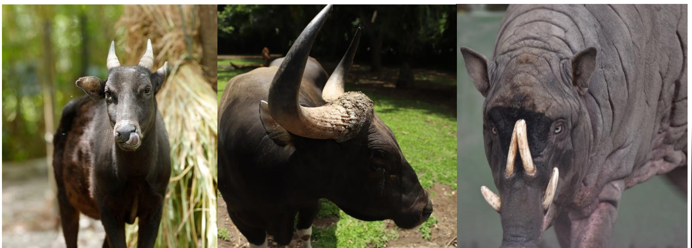
The three GSMP taxa: banteng, anoa (Photos: Bali Safari and Marine Park) and babirusa ( Photo: Surabaya Zoo)