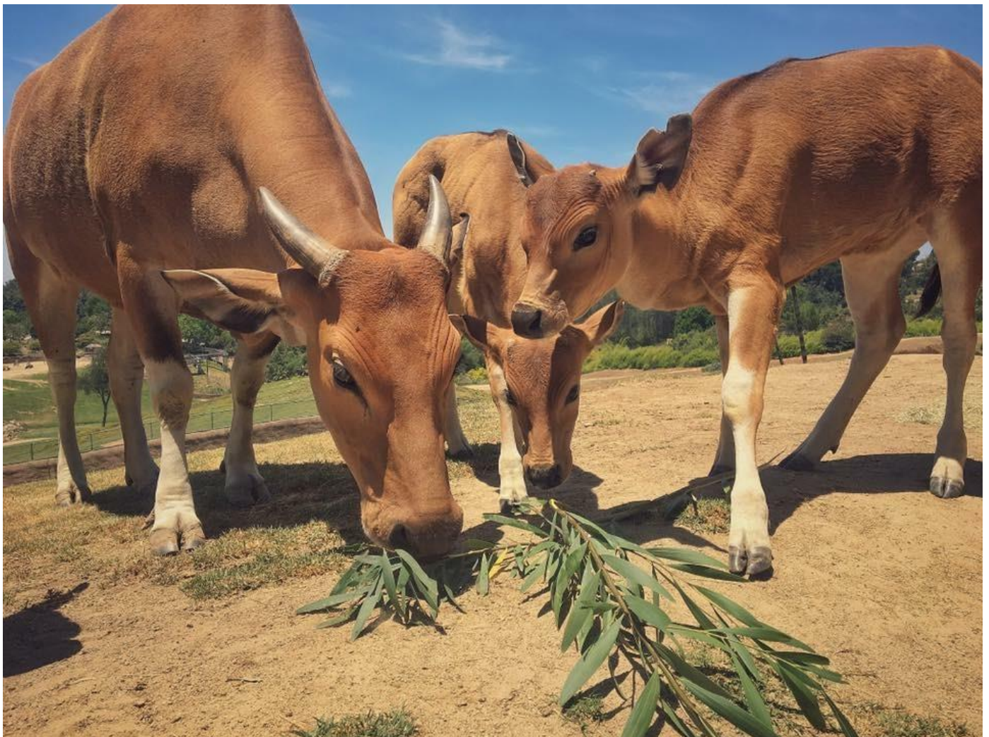
Banteng eating browse at San Diego Zoo.