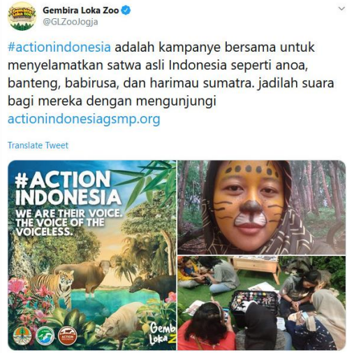
Face painting and social media campaign at Gembira Loka Zoo.