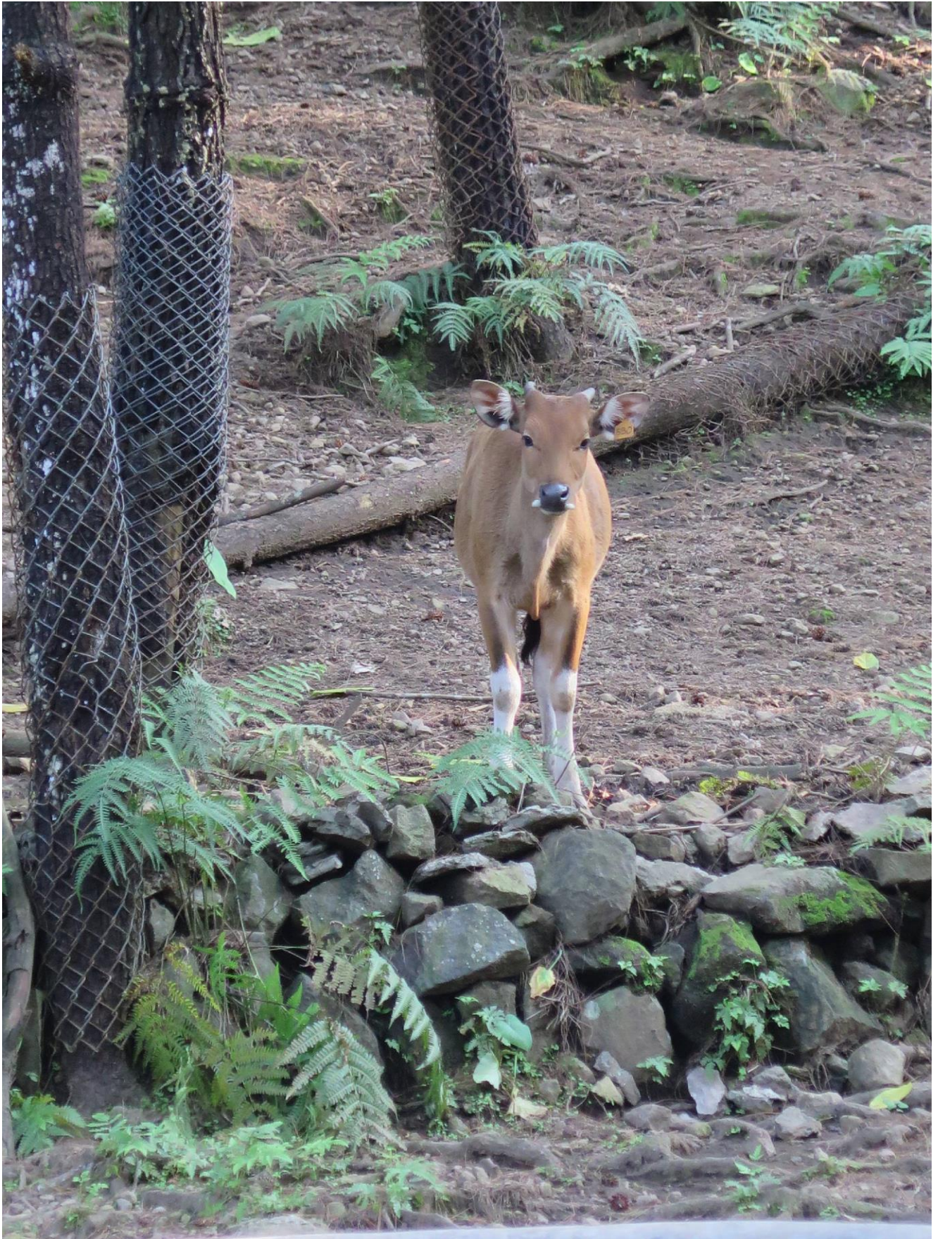
Banteng calf at TSI Prigen.