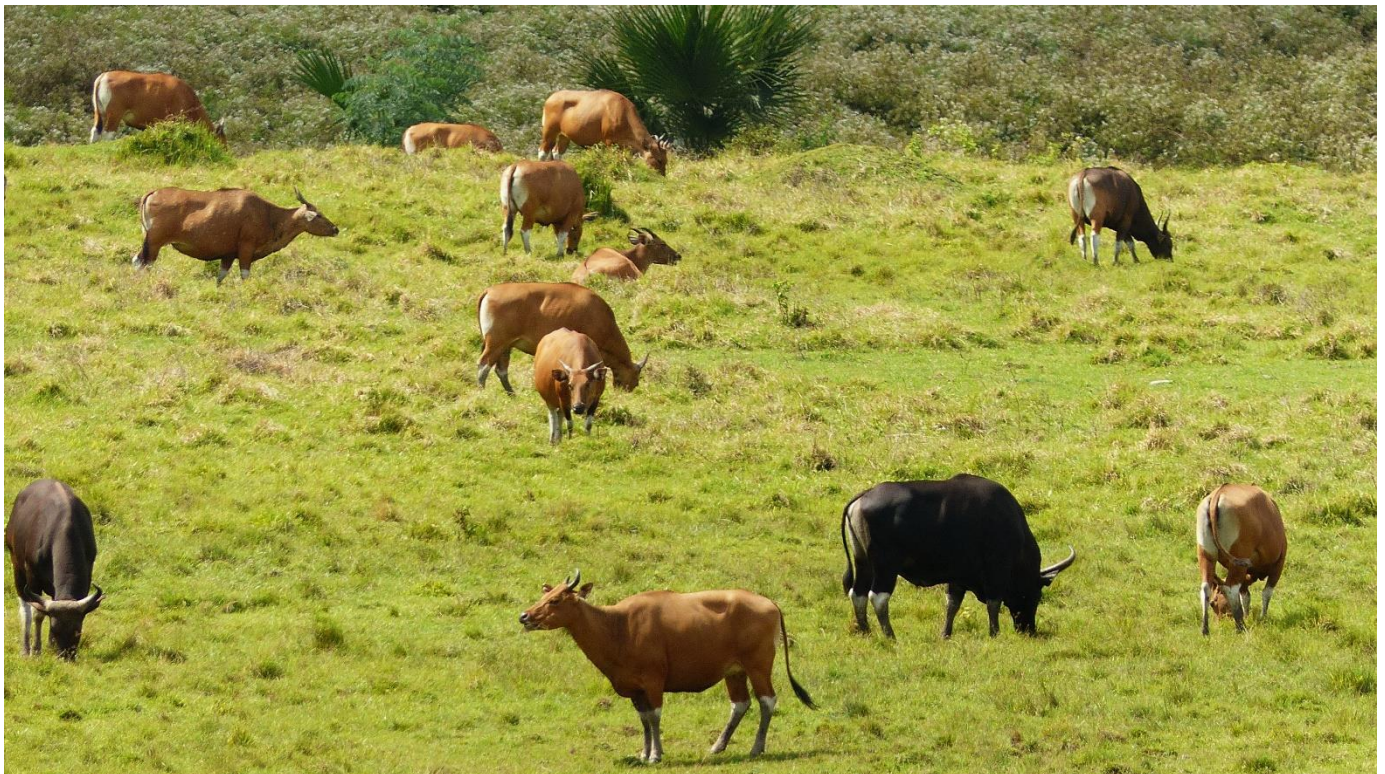
Banteng grazing in Alas Purwo National Park.

2020 will see the hiring of a new Field Coordinator who will work closely with National Park staff and other GSMP partners to develop and coordinate the banteng population monitoring project in Alas Purwo National Park.