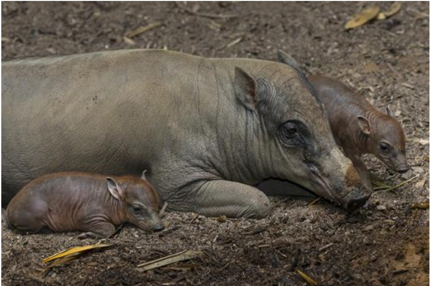
Babirusa piglets at San Diego Zoo.

PKBSI is developing a collaboration with the Indonesian Institute of Science (LIPI) to sample the founder animals of the Indonesian zoo populations. This involves working with many of the Indonesian zoos to collect DNA samples, which will begin soon. The genetic work will be conducted in Indonesia. This collaboration is being supported by Copenhagen Zoo and Queen Mary University of London with technical input to the data analysis as well as training. We hope that much of the technical skills needed for these assessments will be transferred to Indonesian scientists for future use on other species managed in zoos.