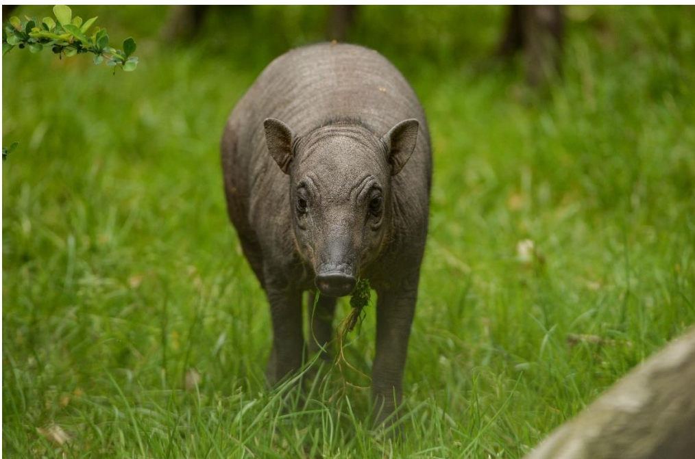
Babirusa at Chester Zoo.

We need your help for the 2020 activities – please get in touch!