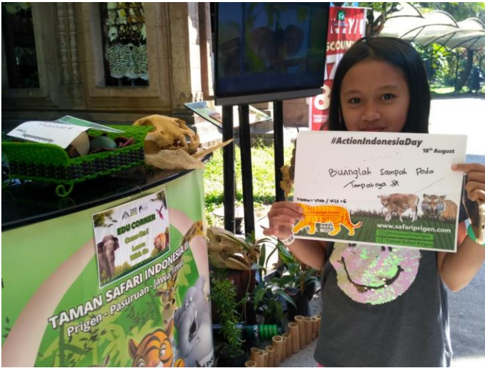
Action Indonesia Day activities at TSI Prigen

Below are some more photos of Action Indonesia Day activities on August 18 th , 2019: