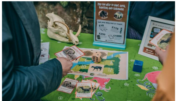
Action Indonesia Day activities at Chester Zoo.