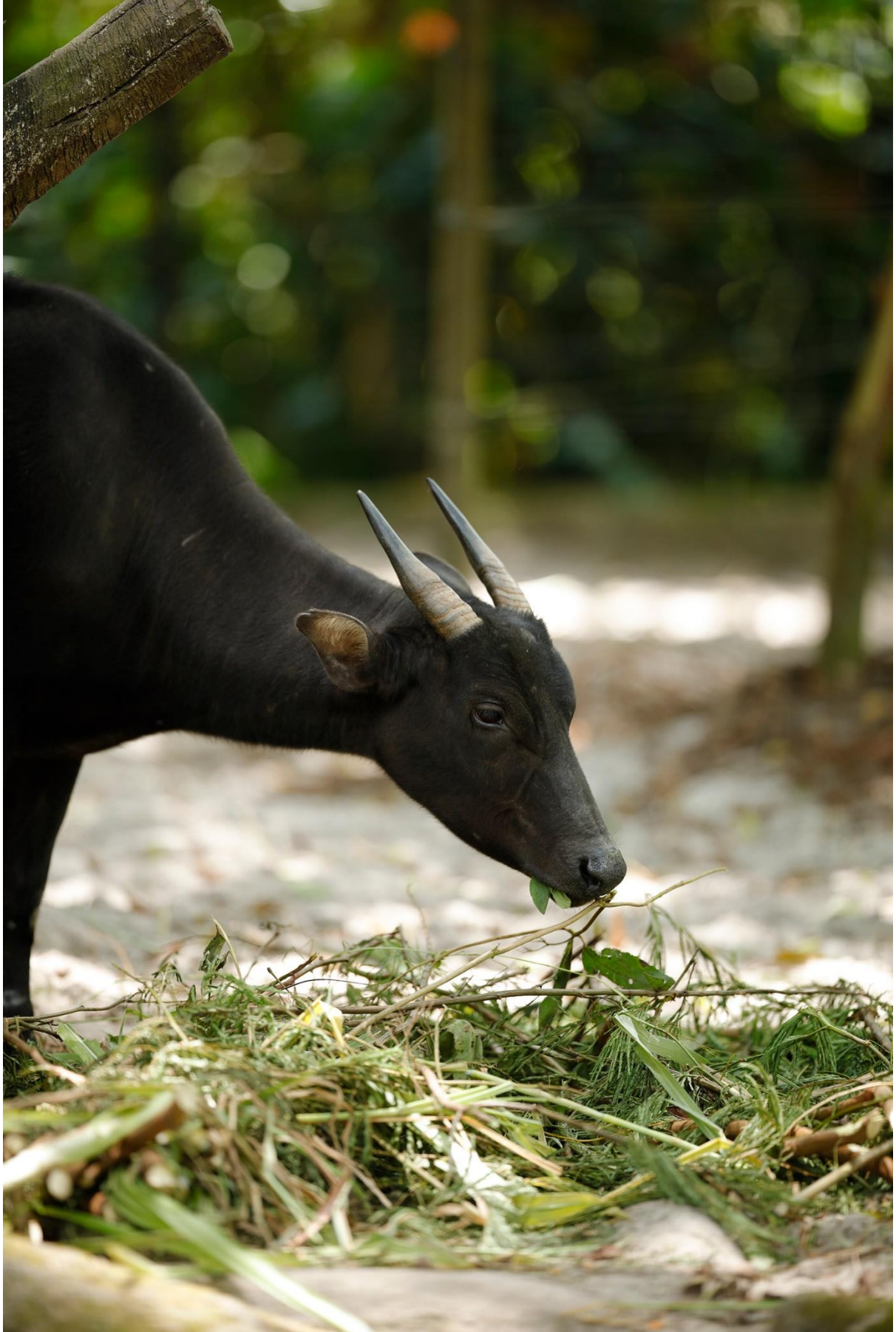
Anoa feeding.